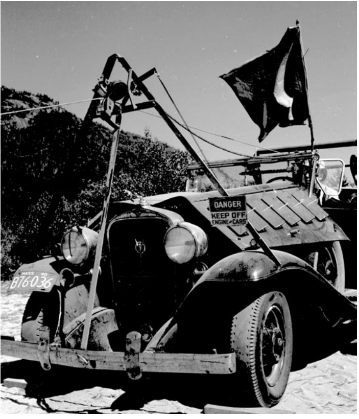
Winch launch at North Conway, NH, September 1940.