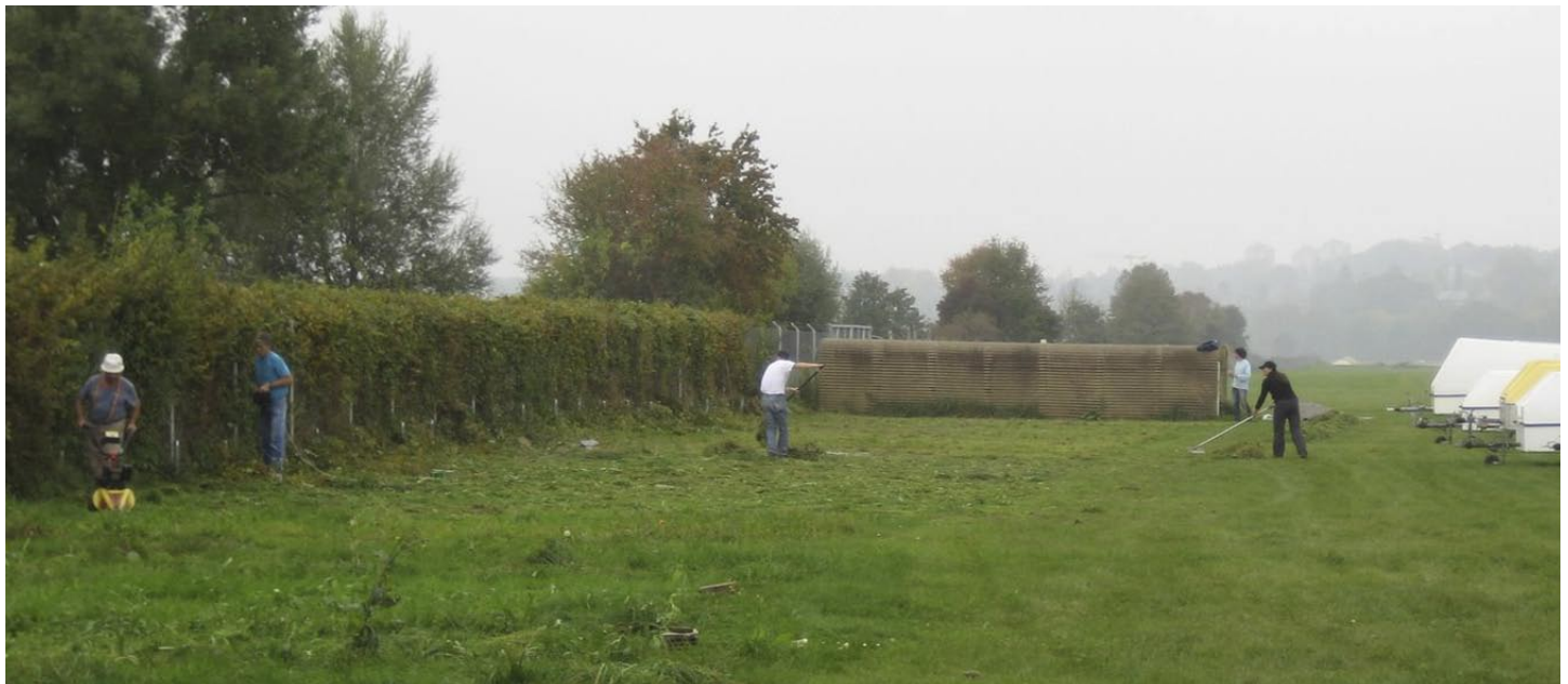
Breitling Chronograph Robin (top) Bautag 2007—the annual volunteer day, included all sorts of round-the-club cleanup, including cutting down the local vegetation.(above) Duo Discus XL (below).