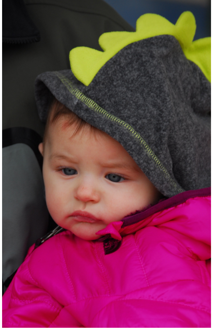
Below: A family portrait— Mama walks a wing, Daddy drives a Gator and Baby stays out of the cold.