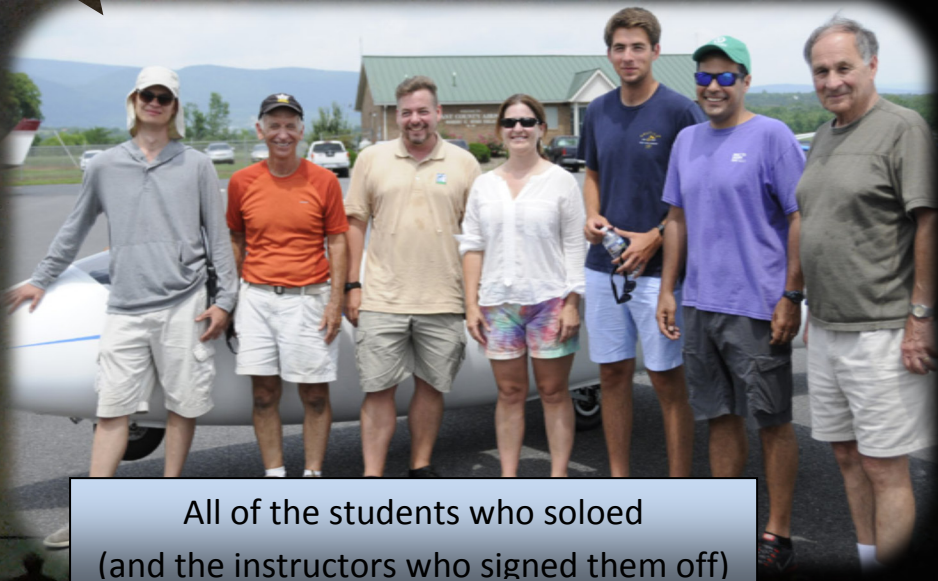
All of the students who soloed (and the instructors who signed them off)