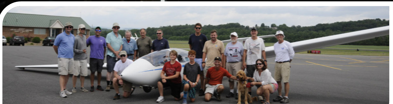
All of the participants in 2017 Week of Training